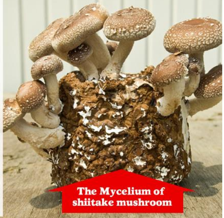
The Mycelium of shiitake mushroom

Process patent : This mycelium contains water-soluble lignin which is working as anti virus and antioxidant. the amount is equal to ten shiitake mushrooms.